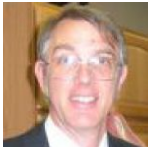
Bob Unruh for WND

Pizzagate connections to Hollywood and Silicon Valley